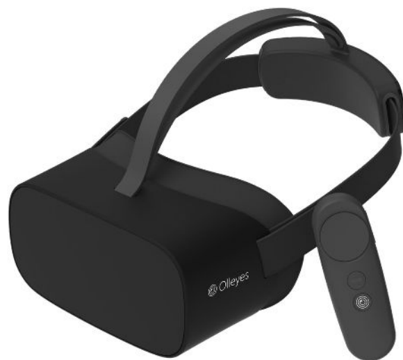
Figure 1. The VisuALL head mounted device (HMD) and Bluetooth connected handpiece.

The hardware includes three main components: a head mounted device (HMD) also known as a VR headset (Fig. 1), a web-capable device (laptop, phone, or tablet) and a Bluetooth connected handpiece (see Fig. 1). The HMD is powered by Pico (Pico Interactive, Inc., San Francisco, CA). It weighs 276 g and includes a Quad High Definition Liquid Crystal Display with a resolution of 3840 × 2160 pixels and a refresh rate